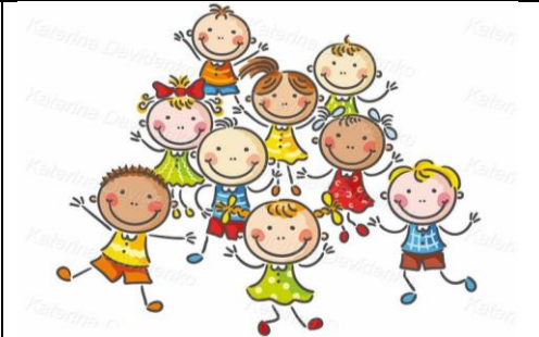
MUSIC ~ DANCE ~ ENERGY