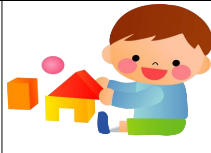
FREE PLAY OR CRAFT